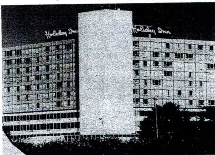
Holiday Inn Waterside Norfolk, Virginia

345th B. G. Reunion Committee 2770 E. Main St. Columbus, Ohio 43209