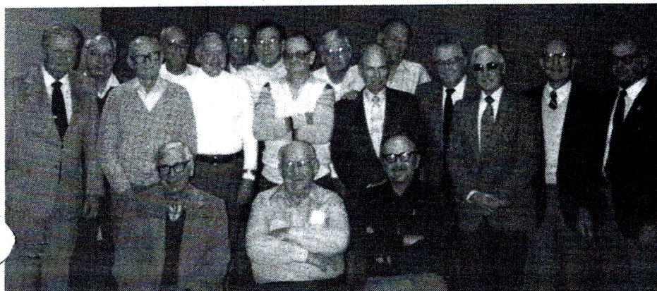
Group Shot of Norfolk Meeting Attendees