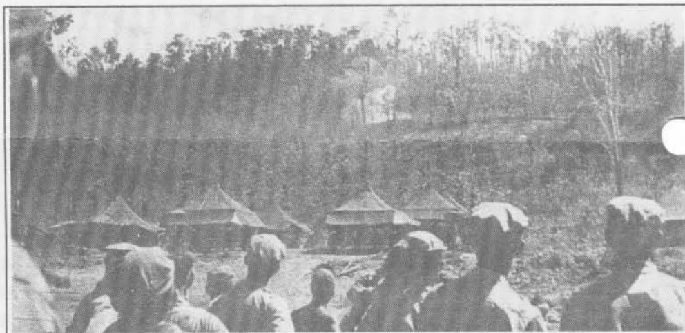
A mortar shell explodes at the entrance to a cave hiding Japanese holdouts on Biak. It was on the hill behind the officers' tents. See story on page one.