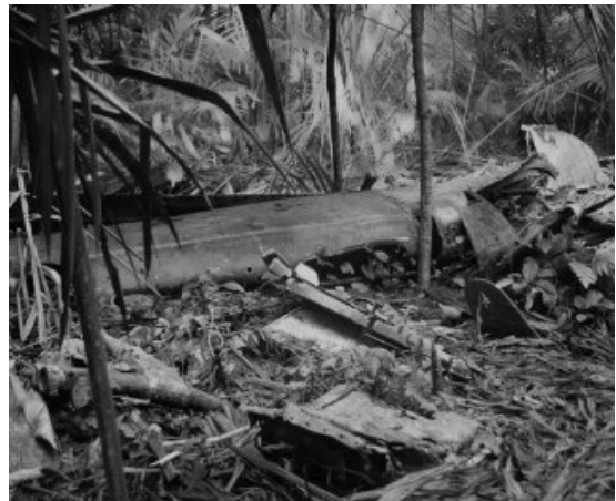
TIN LIZ wreckage near Wewak, May 2009.

The people I met in Papua New Guinea thanked me many times for everything the Americans did to free their country. They were keenly aware of the price paid for their freedom and I felt truly welcomed by them.