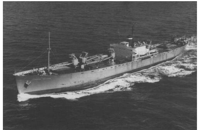
The S.S. Thomas Nelson under way (photo courtesy of armed-guard.com).