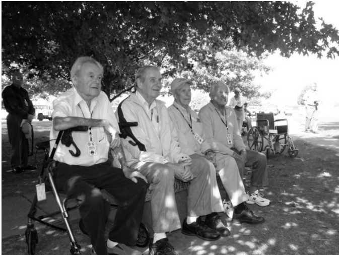
501 st Squadron members attending the rededication of the 345 th Memorial in Dayton, OH.

I want to wish all of you a blessed Christmas, a happy Hanukkah, and a very happy new year!